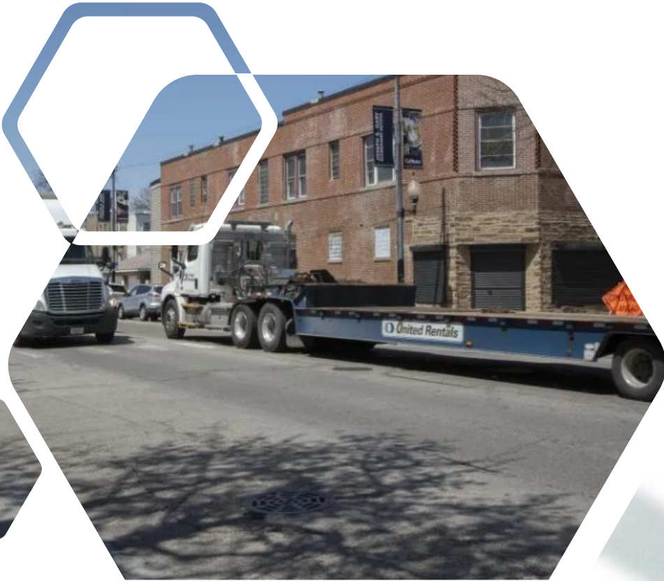
earlier this month. Diesel-fueled trucks are expected to